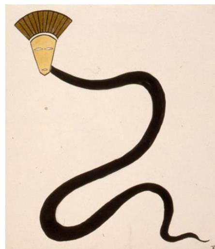
Untitled, anonymous artists from the C. G. Jung Collection.